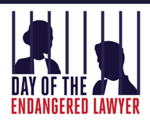
The Day of the endangered lawyer 2021

Since January 2021, the CCBE sent 17 letters in support of endangered lawyers in Belarus, Brazil, China, Egypt, Iraq, Iran, Philippines, Turkey, Uganda and Zimbabwe. All CCBE letters of support to endangered lawyers and other joint initiatives can be consulted on the CCBE Human Rights portal "Defence of the defenders". All lawyers should be able to remain free and independent as well as to carry out their professional duties without fear of reprisal, hindrance, intimidation or harassment in order to preserve the independence and integrity of the administration of justice and the rule of law.